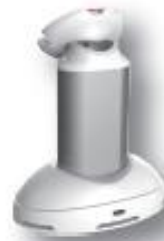
Anti-theft Cradle - Option (Alarming when detached)