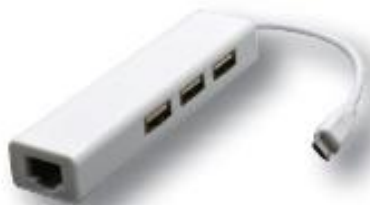
Wired Lan Cable - Option