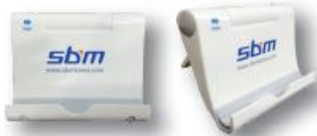
Basic Cradle - Included