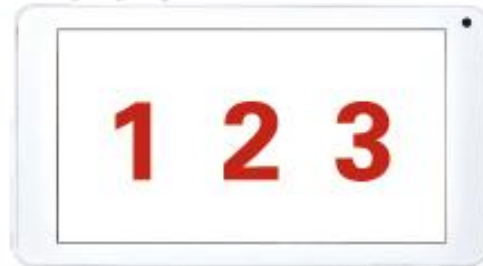
Connection with Queuing system - Option • Connected with queuing system, Aurora displays queue number on its screen